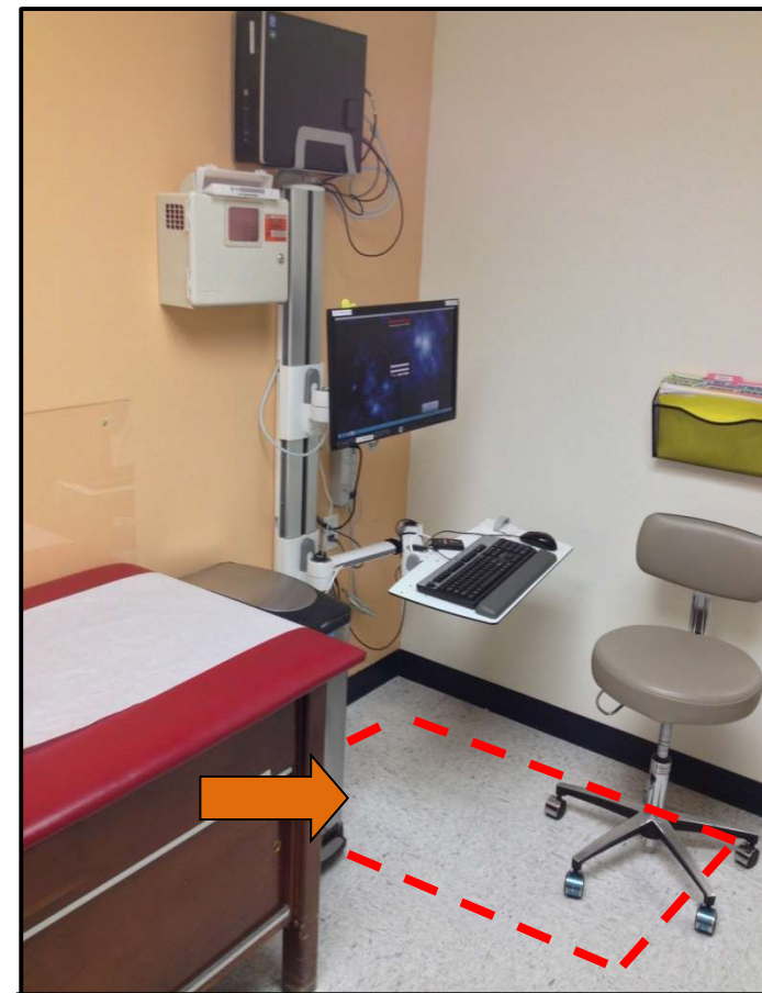
30" x 48" Clear Floor Space

Built-in equipment consoles include recessed or wall mounted Electronic Medical Record (EMR) systems. These units must also comply with US Access Board Section 508 Standards for Electronic and Information Technology. A 30 inch by 48 inch clear floor space , in compliance with Section 11B-305, shall be centered in front of the display screen. Wall-mounted units shall comply with protrusion limits prescribed in Section 11B-307.2. Touch screen units shall be allowed to be vertically mounted with the centerline of the display screen no more than 52 inches above the floor in compliance with Section 11B-707.7.1.1. These units will need the capability of an alternate input method such as a wireless keyboard made available to those who would need it.”